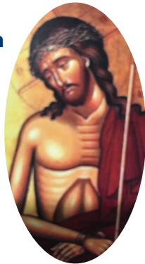
Christ the Bridegroom

At the completion of the agreed upon period of formation the candidate submits a petition for consecration. In this petition, the candidate seeking to be consecrated as a virgin living in the world expresses her aspirations and how she would hope to live out this vocation following her spouse, our poor, chaste and obedient Lord. The bishop makes the final decision about the admittance of the candidate to consecration after considering the recommendation of his delegate.